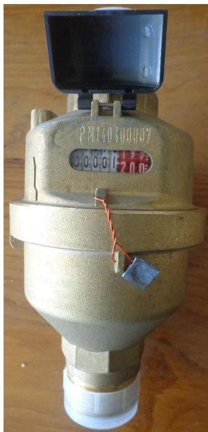
Illustration 1 Photograph of the 25 mm “ASM Model LXH” water meter